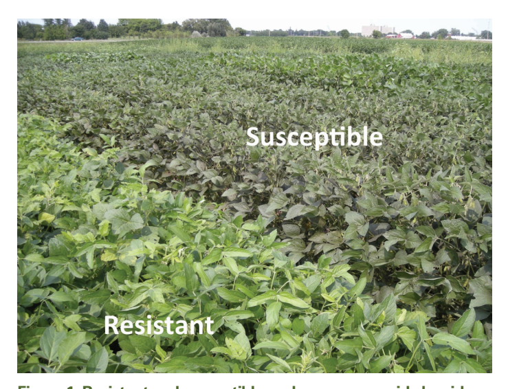
Figure 1. Resistant and susceptible soybeans grown side by side. Sooty mold growing on the honeydew left by aphids makes the susceptible soybeans appear blackened.

Soybean aphid-resistant varieties slow the rate at which soybean aphid populations increase. The resistant plants will not be aphid free, but they will have fewer aphids than susceptible plants. Figures 2 and 3 depict aphid populations from the ISU 2011 Insecticide Evaluation of Soybean Insects Report . At three locations, the soybean aphid-resistant variety containing the Rag1 gene had significantly fewer aphids than the susceptible check line. However, economically damaging populations of aphids have been observed on soybean aphid-resistant varieties in the field. These populations may be due to aphids capable of overcoming the Rag1 gene (termed biotypes), which have been identified in the field. Since aphids are capable of reaching economically damaging levels and resistant aphid biotypes exist, farmers should still regularly scout fields planted with soybean aphid-resistant varieties.