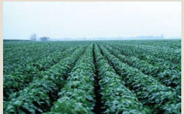
No Symptoms SCN-resistant and -susceptible varieties growing side-by-side in a heavily infested soybean field. There is no way to tell which is which by looking at the plants. In this field, the resistant variety yielded over 30 percent more than the susceptible.