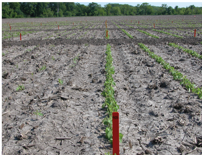
Figure 3. Early planted soybeans should be scouted frequently for bean leaf beetles. Bean leaf beetles were not managed in the plot to the left.

For more information about soybean management go to www.soybeanmanagement.info .