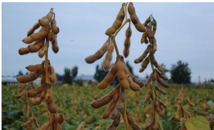
Figure 3. Quick canopy closure and rapid crop growth rate starting at flowering is important to keep photosynthesis going at a high rate to maximize pod and seed set.

Matching soybean varieties to a specific field is the foundation of maximizing soybean yields. Unfortunately, a soybean variety's genetic yield potential is only achieved when environmental conditions are perfect and such conditions rarely exist. Agronomic decisions, however, have much greater impact on yield than most people think. The soybean crop has to be raised as a "biomass" generator without any stress and optimum light interception early in the growing season since lack of biomass and vegetative nodes prior to flowering hold down the yield potential. Understanding how a soybean plant develops through the season will provide insight into selection of management practices that should lead to maintaining the yield potential. Simply putting more inputs into a management system will not improve yield if the crop does not get the right start.