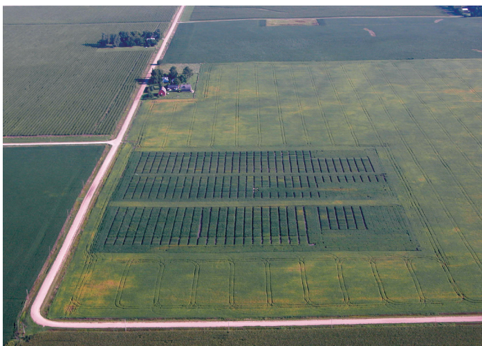
Figure 2. Checkoff funded research near Nevada, Iowa. Investigating agronomic practices using new technologies.