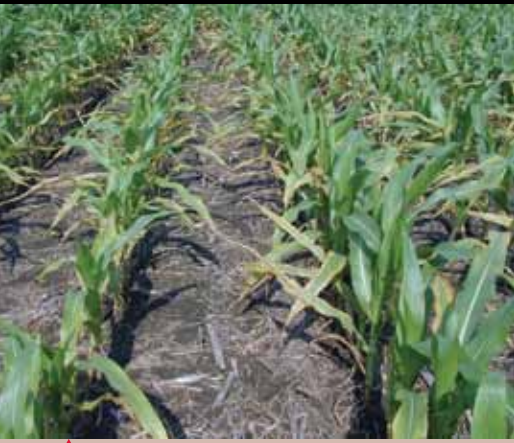
▲ Potassium deficient corn. Symptoms first appear as yellowing and dying of lower leaf margins. Plants with impaired root systems are most likely to show symptoms after about V6 when plant potassium uptake increases. Potassium-deficient corn tends to lodge late in the season.

Research on P and K placement methods for soybean and corn has shown little or no difference between broadcast and band application methods for P, other than a response to a small amount of starter fertilizer for corn under some conditions. However, deep-banding K fertilizer (5 to 7 inches) is usually advantageous in fields managed with ridge-tillage, and often for fields managed with no-till or strip tillage. Research also shows that reducing the application rate when banding is risky, and not recommended.