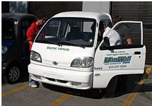
DMACC students check out the Van Wall Group's electric vehicle. The one-day event featured alternative fuel vehicle exhibits, educational breakout sessions, and give-a-ways at the door.