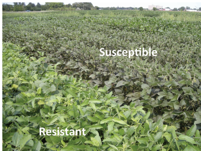
Figure 1. Resistant and susceptible soybeans grown side by side. Sooty mold growing on the honeydew left by aphids makes the susceptible soybeans appear blackened.

Soybean aphid-resistant varieties slow the rate at which soybean aphid populations increase. The resistant plants will not be aphid free, but they will have fewer aphids than susceptible plants. Figures 2 and 3 depict aphid populations from the ISU 2011 Insecticide Evaluation of Soybean Insects Report . At three locations, the soybean aphid-resistant variety containing the Rag1 gene had significantly fewer aphids than the susceptible check line. However, economically damaging populations of aphids have been observed on soybean aphid-resistant varieties in the field. These populations may be due to aphids capable of overcoming the Rag1 gene (termed biotypes), which have been identified in the field. Since aphids are capable of reaching economically damaging levels and resistant aphid biotypes exist, farmers should still regularly scout fields planted with soybean aphid-resistant varieties.